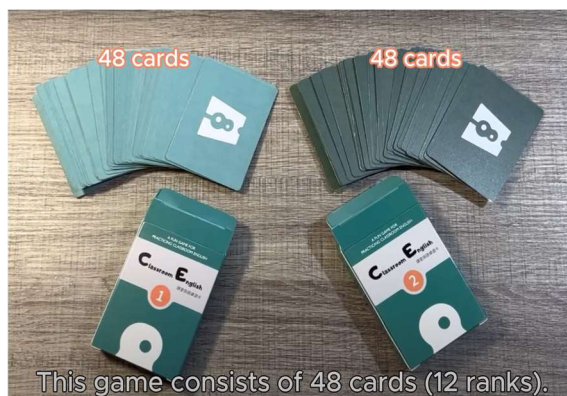
This game consists of 48 cards (12 ranks).